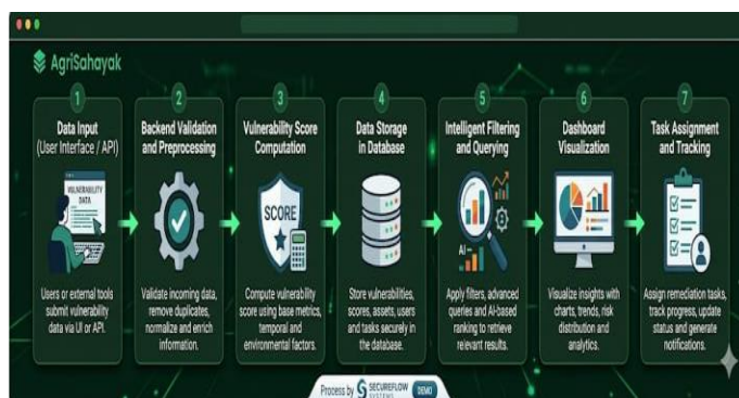
Figure-2: Overall System Architecture of Agriculture Dashboard

MongoDB is used as the primary database system for securely storing crop records, user information, weather data, market prices, fertilizer calculations, and operational records [20].